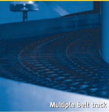
Multiple belt track